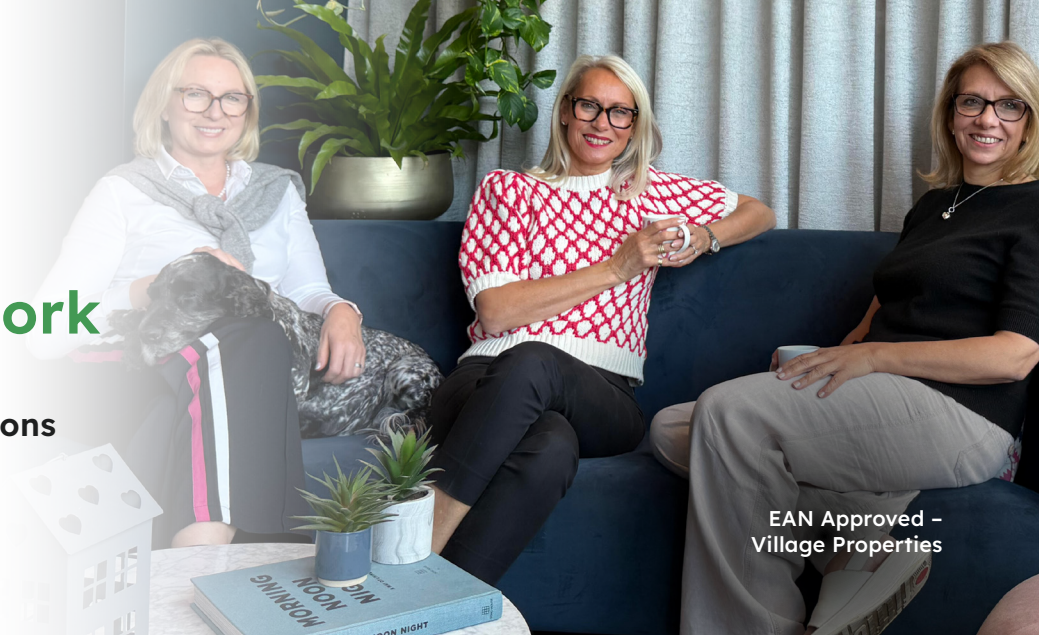
EAN Approved - Village Properties

Here are some of the questions we're most often asked: